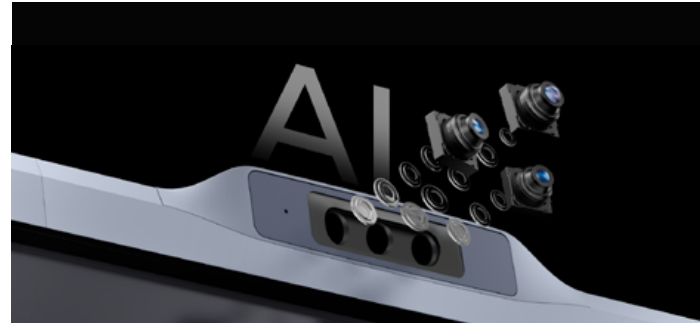
Enhance Your Meeting Experience With Our Innovative AI-Powered Trident Lens System

MAXHUB XBoard features three 50MP cameras: one panoramic and two with 2x optical and 5x hybrid zoom, ensuring clear room views and capturing participant expressions.